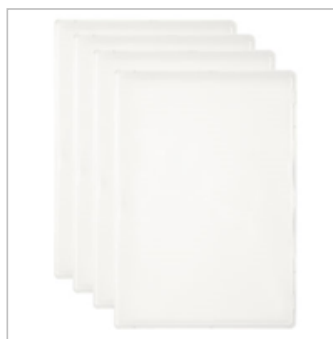
Clear-Mount Stamp Cases