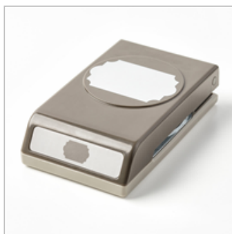
Everyday Label Punch