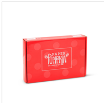
1-Month Prepaid Paper Pumpkin Subscription