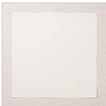
Sparkle Glimmer Paper