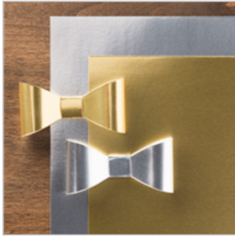
Gold Foil Sheets