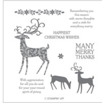
Dashing Deer Clear-Mount Stamp Set