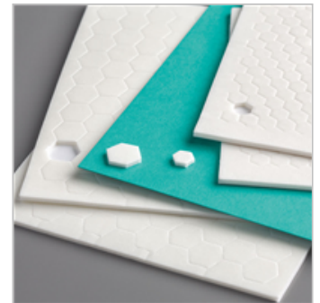
Mini Stampin' Dimensionals