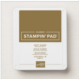
Soft Suede Classic Stampin' Pad