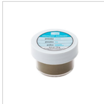
Gold Stampin' Emboss Powder