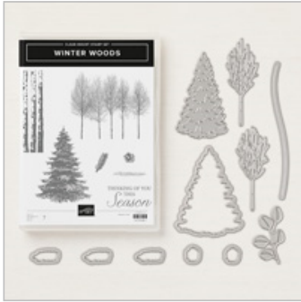
Winter Woods Clear-Mount Bundle