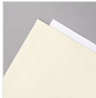
Very Vanilla 8-1/2" X 11" Thick Cardstock