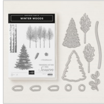
Winter Woods Wood-Mount Bundle