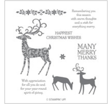
Dashing Deer Wood-Mount Stamp Set