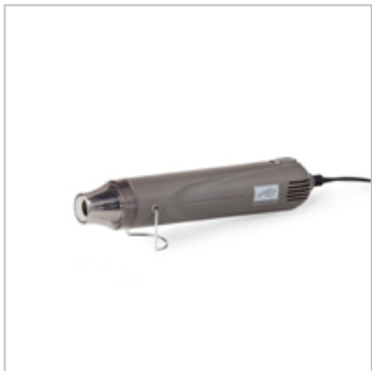
Heat Tool (Us And Canada)