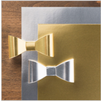
Gold Foil Sheets