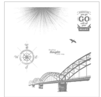
Wherever You Go Wood-Mount Stamp Set