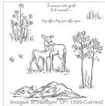
In The Meadow Wood-Mount Stamp Set