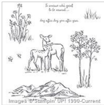
In The Meadow Clear-Mount Stamp Set