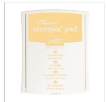
So Saffron Classic Stampin' Pad