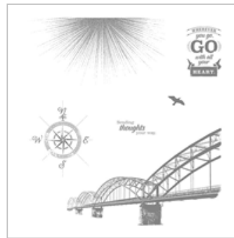
Wherever You Go Clear-Mount Stamp Set