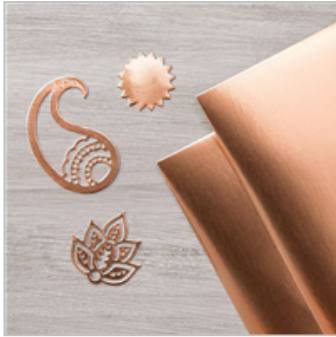
Copper Foil Sheets