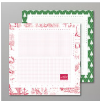
Seasonal 2019 13" X 13" (33 X 33 Cm) Grid Paper