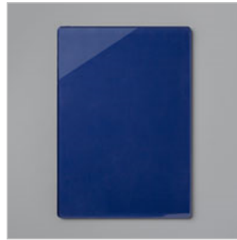
3D Embossing Folder Plate