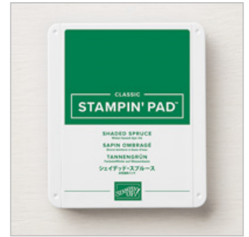
Shaded Spruce Classic Stampin' Pad