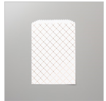
Copper Dotted Treat Bags