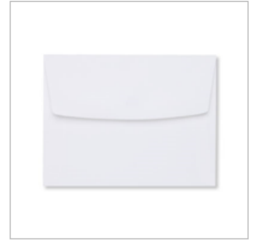
Whisper White Medium Envelopes