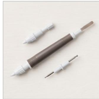
Take Your Pick