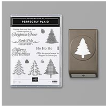
Perfectly Plaid Bundle (En)