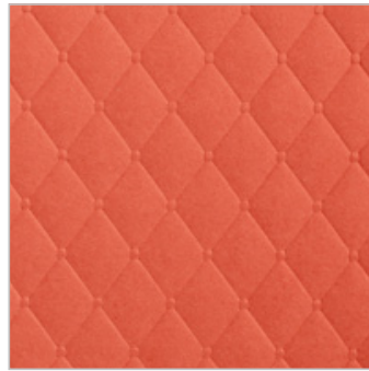
Tufted 3D Embossing Folder