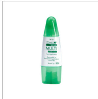
Multipurpose Liquid Glue