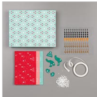
Let It Snow Embellishment Kit