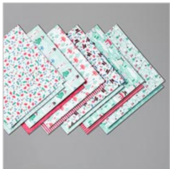
Let It Snow Specialty Designer Series Paper