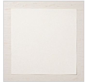
Sparkle Glimmer Paper