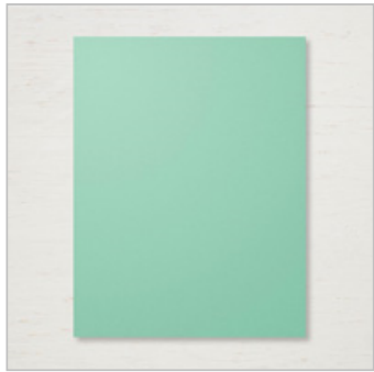
Coastal Cabana 8-1/2" X 11" Cardstock