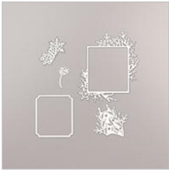
Frosted Frames Dies