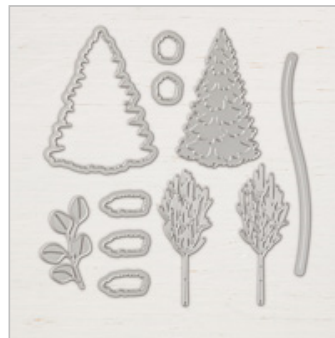
In The Woods Dies