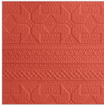
Winter Knit 3D Embossing Folder