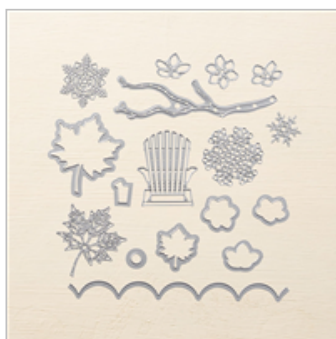
Seasonal Layers Thinlits Dies