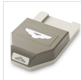
Scalloped Tag Topper