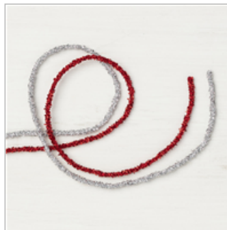
Mini Tinsel Trim