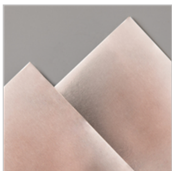
Champagne Foil Sheets