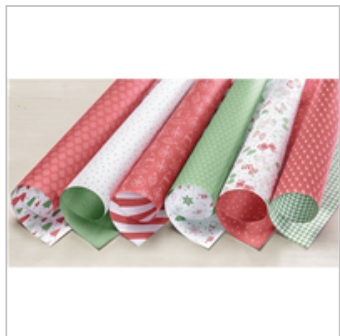
Be Merry Designer Series Paper