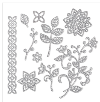
Flourish Thinlits Dies