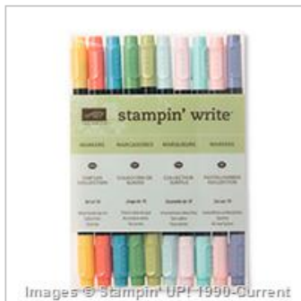
Subtles Stampin' Write Markers