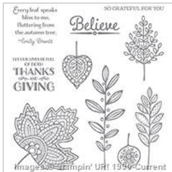
Lighthouse Leaves Photopolymer Stamp Set