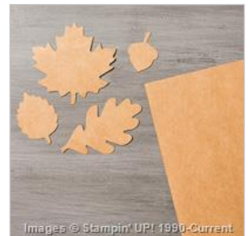
Kraft 12" X 12" (30.5 X 30.5 Cm) Cardstock