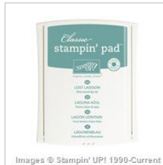
Lost Lagoon Classic Stampin' Pad