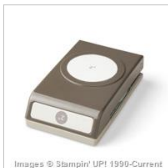
2" (5.1 Cm) Circle Punch