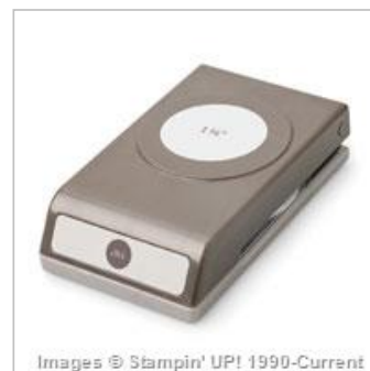
1-3/4" (4.4 Cm) Circle Punch