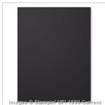
Basic Black 8-1/2" X 11" Cardstock