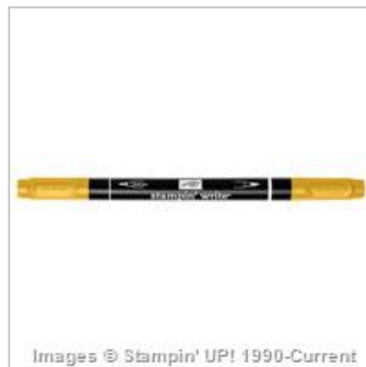
Crushed Curry Stampin' Write Marker