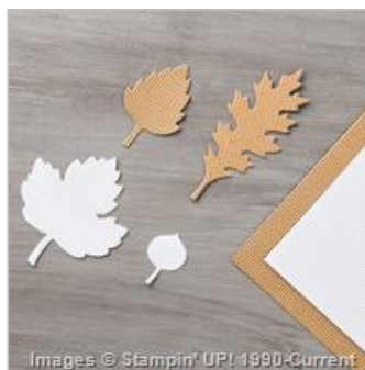
Kraft And White Corrugated Paper