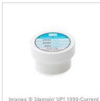
White Stampin' Emboss Powder