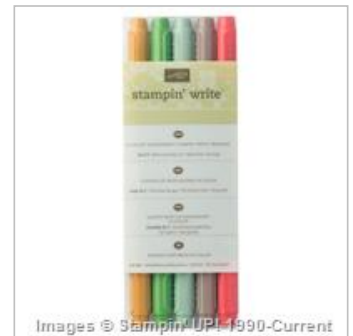
2015-2017 In Color Stampin' Write Markers