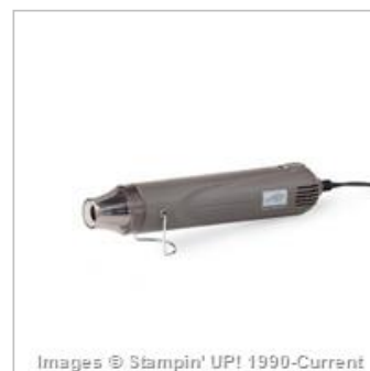
Heat Tool (Us And Canada)