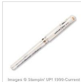
White Signo Uni-Ball Gel Pen