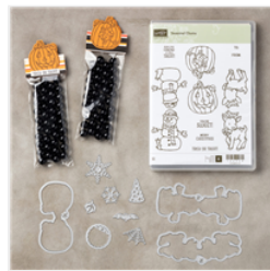
Seasonal Chums Clear-Mount Bundle* - 146077