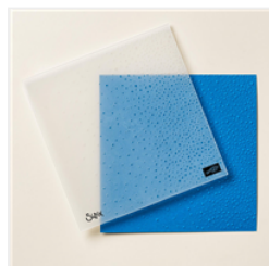
Softly Falling Textured Impressions Embossing Folder - 139672