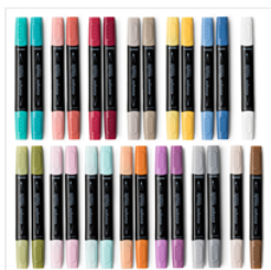
Stampin' Blends Markers Collection - 147475