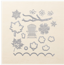
Seasonal Layers Dies - 143751