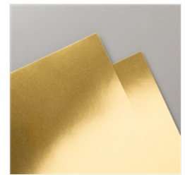
Gold Foil Sheets - 132622