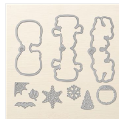
Seasonal Tags Framelits Dies - 144685