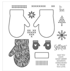
Smitten Mittens Photopolymer Stamp Set* - 144931