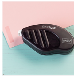
Fast Fuse Adhesive - 129026