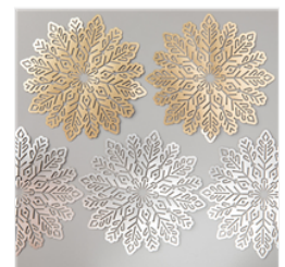
Foil Snowflakes* - 144642