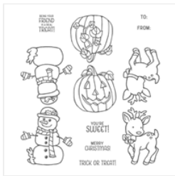
Seasonal Chums Clear-Mount Stamp Set - 144948