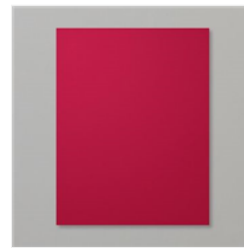
Cherry Cobbler 8- 1/2" X 11" Cardstock - 119685