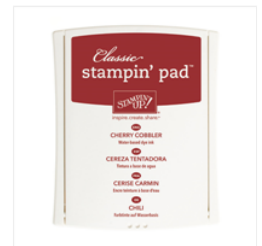
Cherry Cobbler Classic Stampin' Pad - 126966