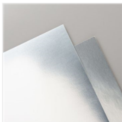
Silver Foil Sheets - 132178