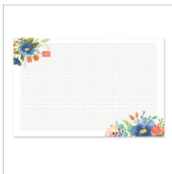
Floral Grid Paper