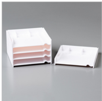
Ink Pad & Marker