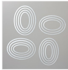
Layering Ovals Dies - 141706