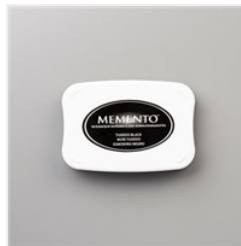
Tuxedo Black Memento Ink Pad - 132708