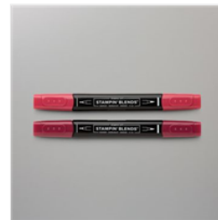
Cherry Cobbler Stampin' Blends Combo Pack - 144598