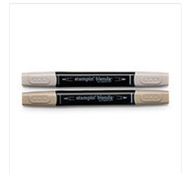
Crumb Cake Stampin' Blends Markers Combo Pack - 144601