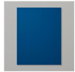
Night Of Navy 8-1/2" X 11" Cardstock - 100867