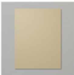
Crumb Cake 8-1/2" X 11" Cardstock - 120953