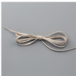
3/16" (4.8 Mm) Braided Linen Trim - 147808