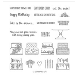
Piece Of Cake Photopolymer Stamp Set - 148610