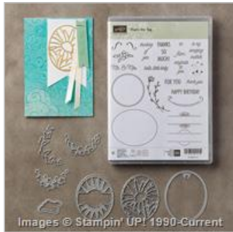
That'S The Tag Photopolymer Bundle

lindaluvs2stamp@aol.com www.lindaluvs.stampinup.net