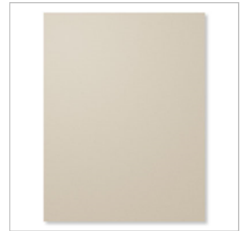
Sahara Sand 8-1/2" X 11" Cardstock