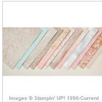
Falling In Love Designer Series