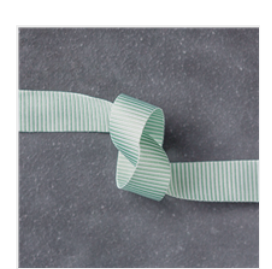
Mint Macaron 5/8" (1.6 Cm) Mini Striped Ribbon