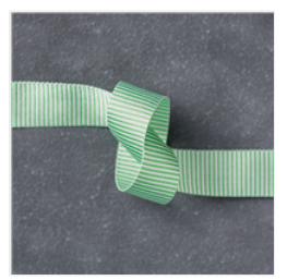
Cucumber Crush 5/8" (1.6 Cm) Mini Striped Ribbon