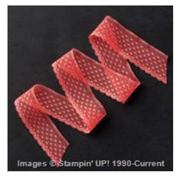
Watermelon Wonder 1" Dotted Lace Trim