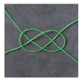
Cucumber Crush Thick Baker's Twine