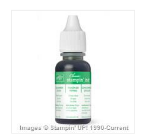
Cucumber Crush Classic Stampin' Ink Refill