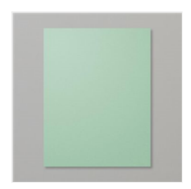
Mint Macaron 8-1/2" X 11" Cardstock