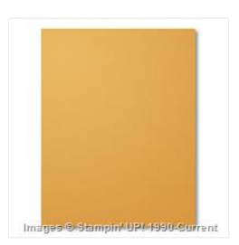
Delightful Dijon 8-1/2" X 11" Cardstock