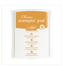
Delightful Dijon Classic Stampin' Pad