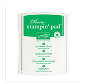
Cucumber Crush Classic Stampin' Pad