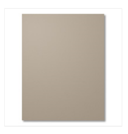
Tip Top Taupe 8-1/2" X 11" Cardstock