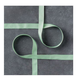
Mint Macaron 3/8" (1 Cm) Sheer Linen Ribbon