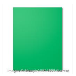
Cucumber Crush 8-1/2" X 11" Cardstock