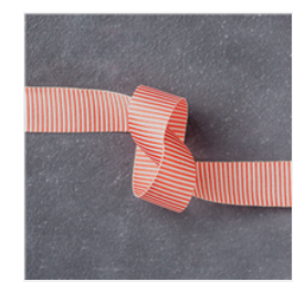
Watermelon Wonder 5/8" (1.6 Cm) Mini Striped Ribbon