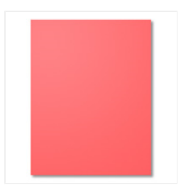
Watermelon Wonder 8-1/2" X 11" Cardstock