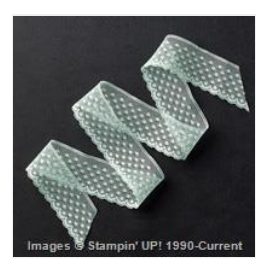
Mint Macaron 1" Dotted Lace Trim