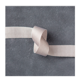
Tip Top Taupe 5/8" (1.6 Cm) Mini Striped Ribbon