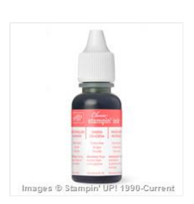
Watermelon Wonder Classic Stampin' Ink Refill