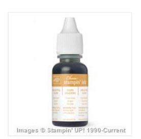
Delightful Dijon Classic Stampin' Ink Refill