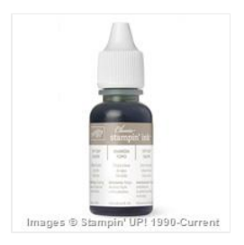
Tip Top Taupe Classic Stampin' Ink Refill