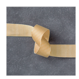
Delightful Dijon 5/8" (1.6 Cm) Mini Striped Ribbon