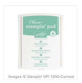
Mint Macaron Classic Stampin' Pad