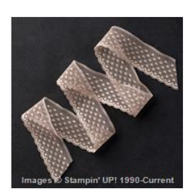
Tip Top Taupe 1" Dotted Lace Trim