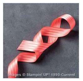
Watermelon Wonder 1" Stitched Satin Ribbon