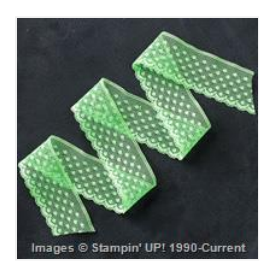
Cucumber Crush 1" Dotted Lace Trim