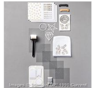
You're So Lovely Project Kit