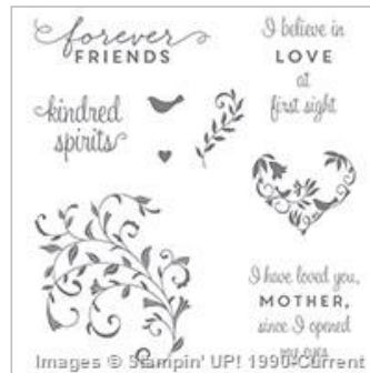
First Sight Wood-Mount Stamp Set