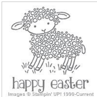
Easter Lamb Wood-Mount Stamp