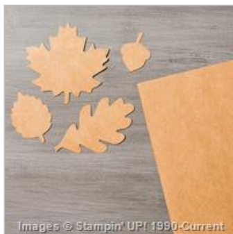
Kraft 12" X 12" (30.5 X 30.5 Cm) Cardstock