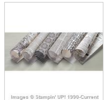
Typeset Specialty Designer Series Paper