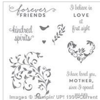
First Sight Clear-Mount Stamp Set