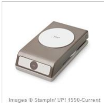
2-1/2" Circle Punch