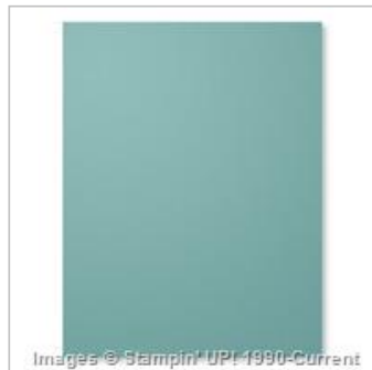
Lost Lagoon 8-1/2" X 11" Cardstock