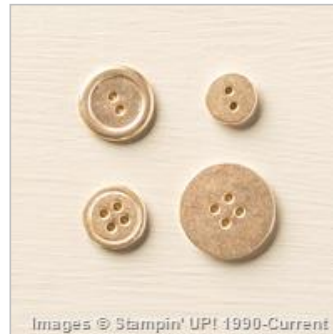
Gold Basic Metal