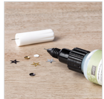
Fine-Tip Glue Pen