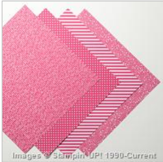
Brights Designer Series Paper Stack