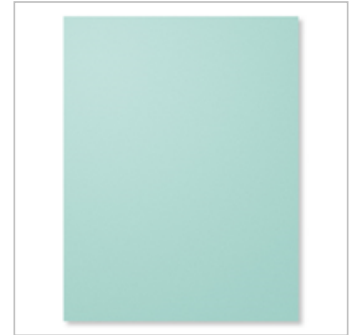
Pool Party 8-1/2" X 11" Cardstock