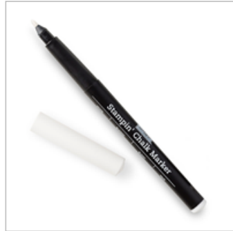
White Stampin' Chalk Marker