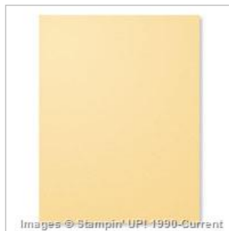
So Saffron 8-1/2" X 11" Cardstock