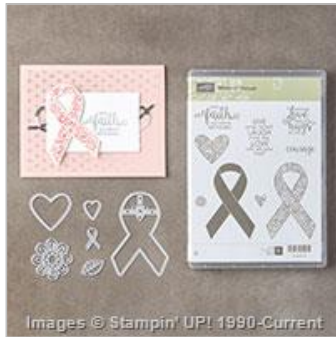
Ribbon Of Courage Clear-Mount Bundle