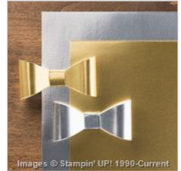
Silver Foil Sheets