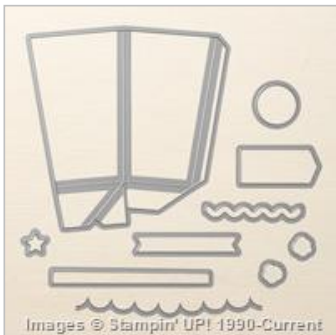
Popcorn Box Thinlits