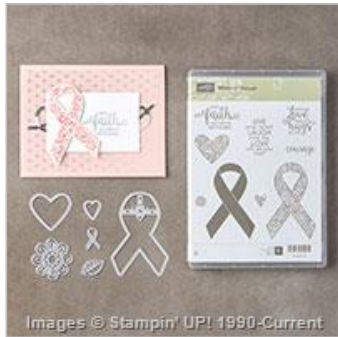
Ribbon Of Courage Clear-Mount Bundle