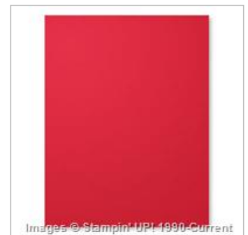
Real Red 8-1/2" X 11" Cardstock