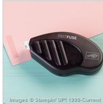
Fuse Fast Adhesive