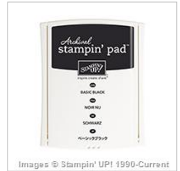
Basic Black Archival Stampin' Pad