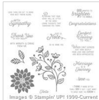
Flourishing Phrases Wood-Mount Stamp