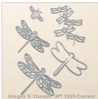
Detailed Dragonfly Thinlits Dies