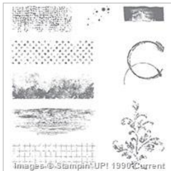
Timeless Textures Clear-Mount Stamp