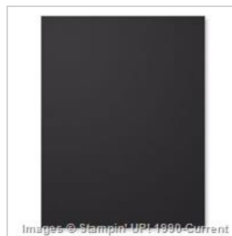
Basic Black 8-1/2" X 11" Cardstock