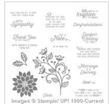
Flourishing Phrases Clear-Mount Stamp