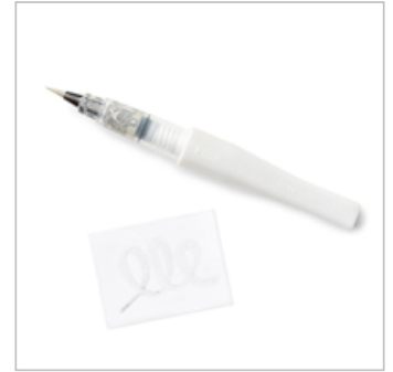
Clear Wink Of Stella Glitter Brush