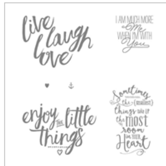
Layering Love Wood- Mount Stamp Set