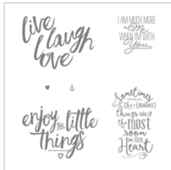
Layering Love Clear- Mount Stamp Set