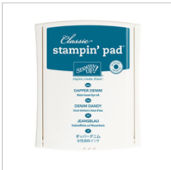
Dapper Denim Classic Stampin' Pad