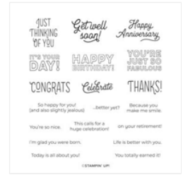
Many Mates Cling Stamp Set (En) - 152633