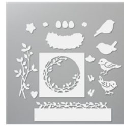
Birds & More Dies - 152721