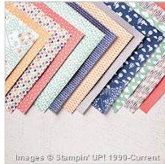
Carried Away Designer Series