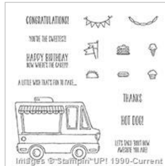
Tasty Trucks Photopolymer Stamp