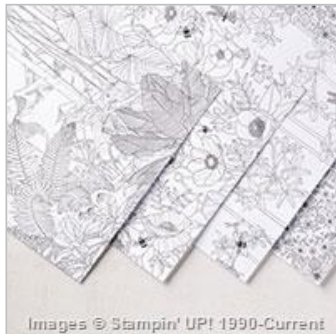
Inside The Lines Designer Series