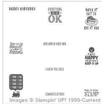
Designer Tee Wood-Mount Stamp Set