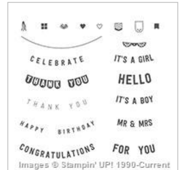
Any Occasion Photopolymer Stamp