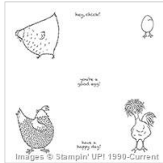
Hey Chick Wood-Mount Stamp Set