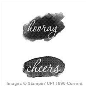
Reverse Words (Wood)