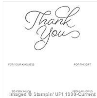
So Very Much Wood- Mount Stamp Set