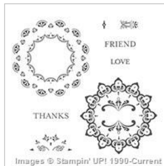
Make A Medallion (Photopolymer)