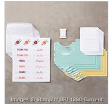
Pretty Pocket Card Kit