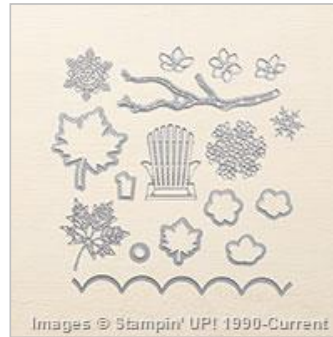
Seasonal Layers Thinlits Dies