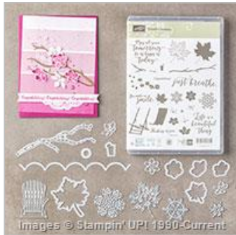
Colorful Seasons Photopolymer Bundle