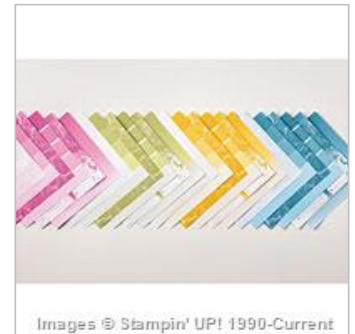
Color Theory Designer Series Paper Stack