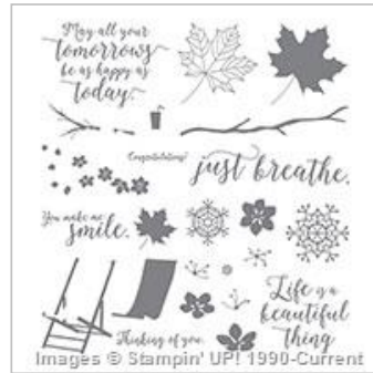
Colorful Seasons Photopolymer Stamp