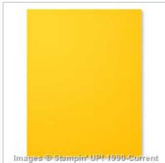
Crushed Curry 8-1/2" X 11" Cardstock