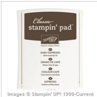
Early Espresso Classic Stampin' Pad