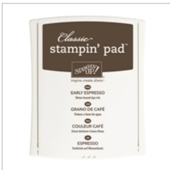
Early Espresso Classic Stampin' Pad