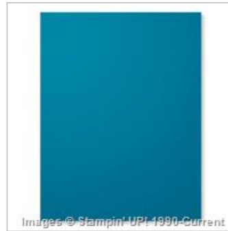
Dapper Denim 8-1/2" X 11" Cardstock