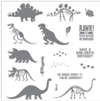
No Bones About It Photopolymer Stamp

http://www.stampinup.net/esuite/home/101/projects/