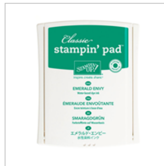
Emerald Envy Classic Stampin' Pad