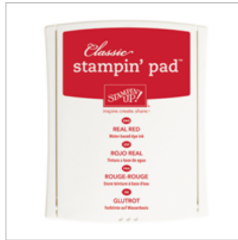
Real Red Classic Stampin' Pad