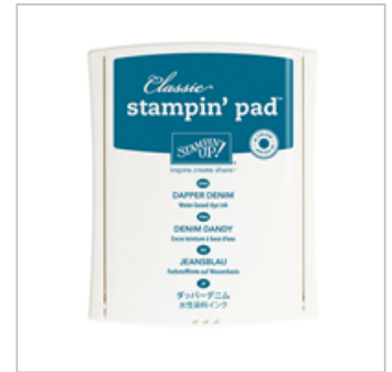
Dapper Denim Classic Stampin' Pad