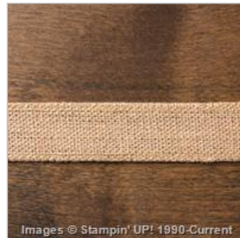
1-1/4" Burlap Ribbon