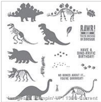
No Bones About It Photopolymer Stamp

www.stampinup.net/esuite/home/101/projects/