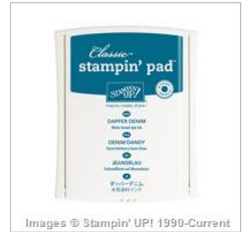
Dapper Denim Classic Stampin' Pad