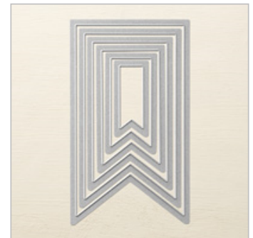
Banners Framelits Dies