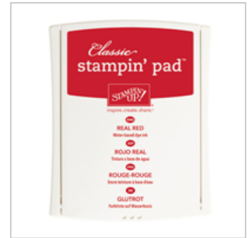
Real Red Classic Stampin' Pad