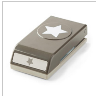
Medium Star Punch