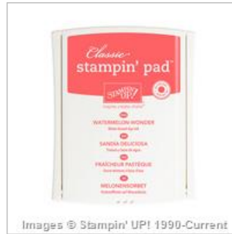
Watermelon Wonder Classic Stampin' Pad