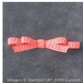
Flirty Flamingo 3/8" (1 Cm) Ruched Ribbon