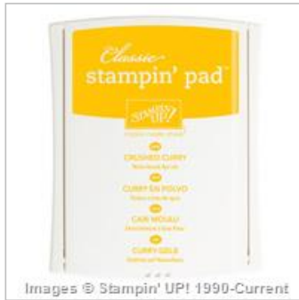
Crushed Curry Classic Stampin' Pad