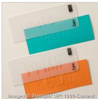
Celebrations Duo Textured Impressions Embossing Folders