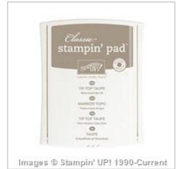
Tip Top Taupe Classic Stampin' Pad