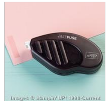
Fuse Fast Adhesive