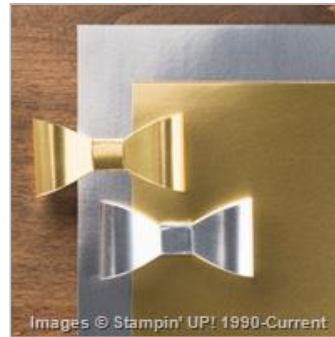
Gold Foil Sheets