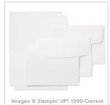
Whisper White Note Cards & Envelopes