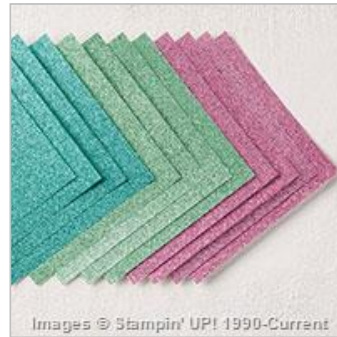
6" X 6" (15.2 Cm X 15.2 Cm) Glimmer Paper Assortment Pack