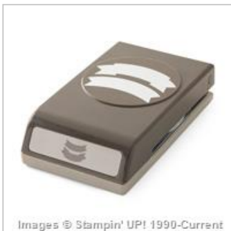
Duet Banner Punch