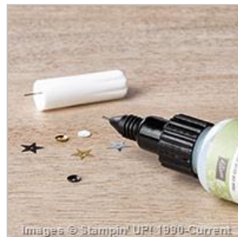
Fine-Tip Glue Pen