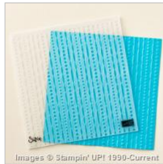
Festive Textured Impressions Embossing Folder