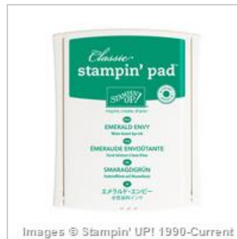
Emerald Envy Classic Stampin' Pad