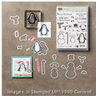
Snow Place Photopolymer Bundle