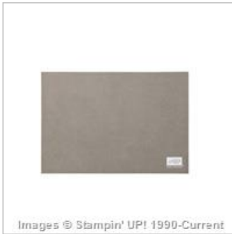
Stampin' Pierce Mat