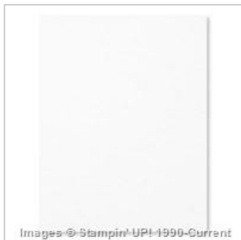
Whisper White 8-1/2" X 11" Cardstock