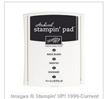
Basic Black Archival Stampin' Pad