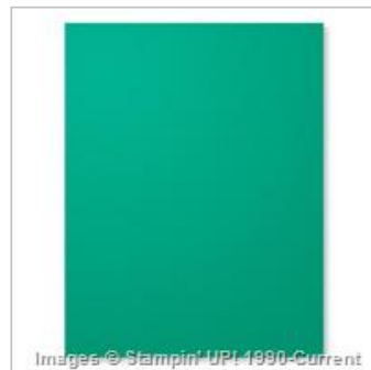
Emerald Envy 8-1/2" X 11" Cardstock