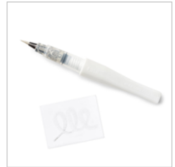
Clear Wink Of Stella Glitter Brush