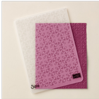
Garden Trellis Textured Impressions Embossing Folder