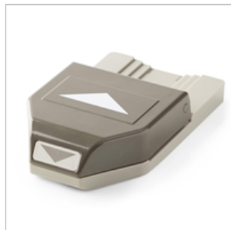
Banner Triple Punch