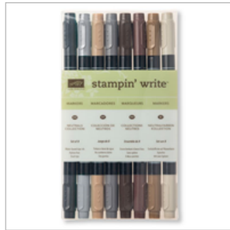
Neutrals Stampin' Write Markers