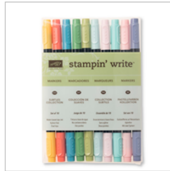
Subtles Stampin' Write Markers