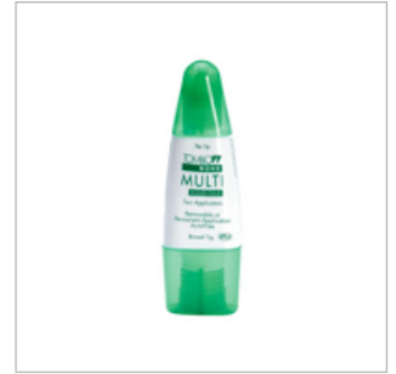
Multipurpose Liquid Glue