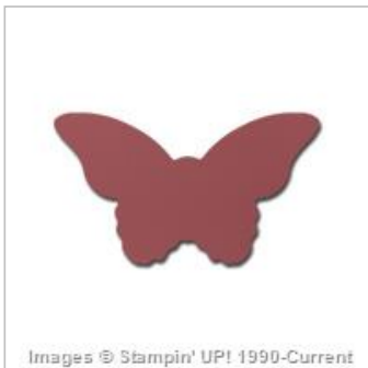
Bitty Butterfly Punch