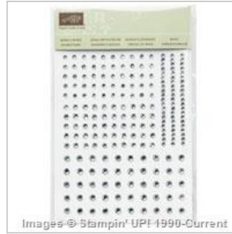
Rhinestone Basic Jewels