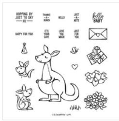
Kangaroo & Company Photopolymer Stamp Set - 154502