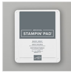
Basic Gray Classic Stampin' Pad - 149165