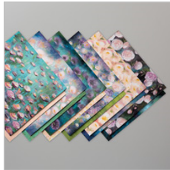
Perennial Essence Designer Series