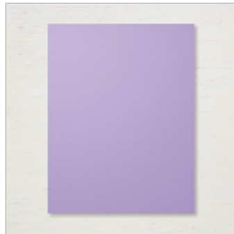
Highland Heather 8-1/2" X 11" Cardstock