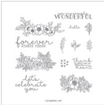
Bloom & Grow Photopolymer Stamp

Tracy Bradley tracy@stampingwithtracy.com www.stampingwithtracy.com