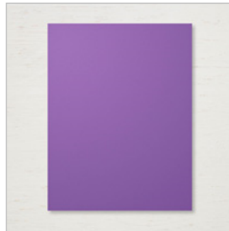
Gorgeous Grape 8-1/2" X 11" Cardstock