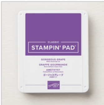
Gorgeous Grape Classic Stampin' Pad