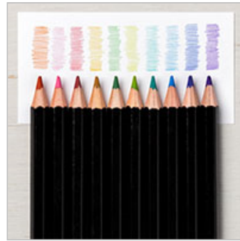
Watercolor Pencils Assortment 2