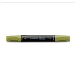
Old Olive Dark Stampin' Blends Marker - 144573