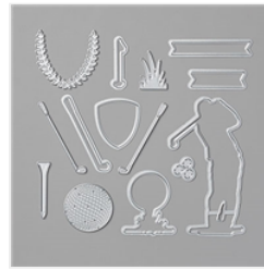
Golf Club Dies - 151580