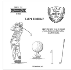
Clubhouse Cling Stamp Set - 151583