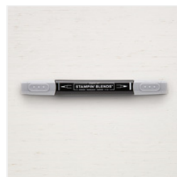
Basic Black Light Stampin' Blends Marker - 147940