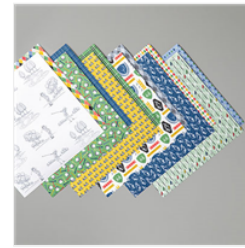
Country Club Designer Series Paper - 151314