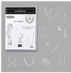
Clubhouse Bundle - 153816