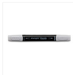
Smoky Slate Light Stampin' Blends Marker - 145054