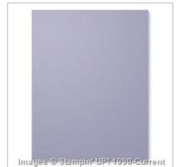
Wisteria Wonder 8-1/2" X 11" Cardstock