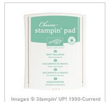
Mint Macaron Classic Stampin' Pad