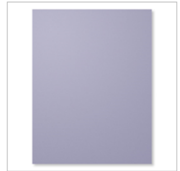
Wisteria Wonder 8-1/2" X 11" Cardstock