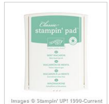
Mint Macaron Classic Stampin' Pad