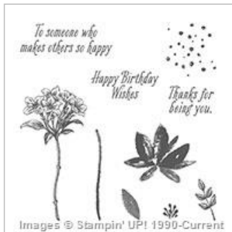
Avant Garden Photopolymer Stamp