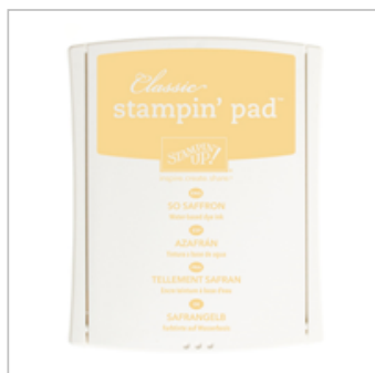
So Saffron Classic Stampin' Pad