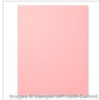
Blushing Bride 8-1/2" X 11" Cardstock 131198