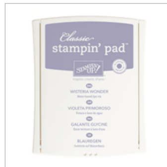
Wisteria Wonder Classic Stampin' Pad