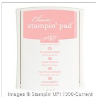
Blushing Bride Classic Stampin' Pad