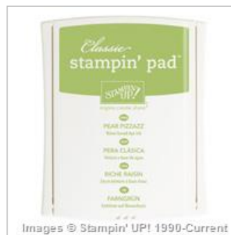
Pear Pizzazz Classic Stampin' Pad