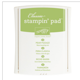
Pear Pizzazz Classic Stampin' Pad