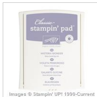
Wisteria Wonder Classic Stampin' Pad