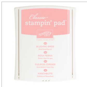
Blushing Bride Classic Stampin' Pad