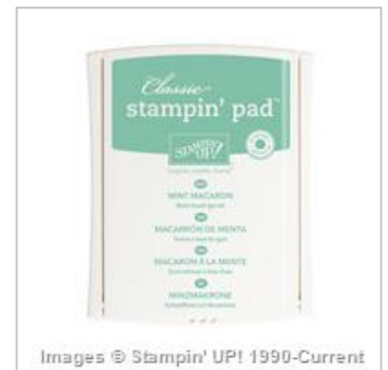
Mint Macaron Classic Stampin' Pad 138326