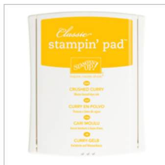
Crushed Curry Classic Stampin' Pad