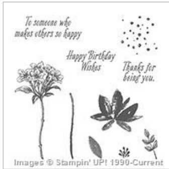
Avant Garden Photopolymer Stamp