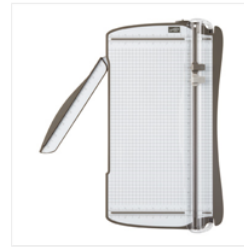
Stampin' Trimmer - 126889