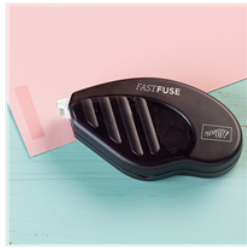
Fast Fuse Adhesive - 129026