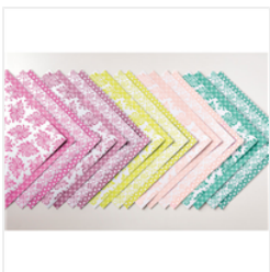
Fresh Florals Designer Series Paper Stack - 144131