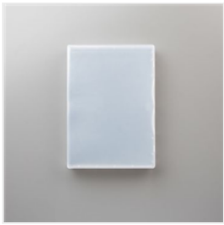
Full Wood-Mount Stamp Cases - 127551