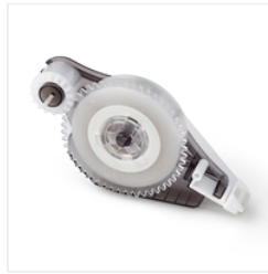
Fast Fuse Adhesive Refill - 129027