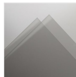
Window Sheets - 142314