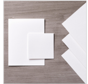
Whisper White 8-1/2" X 11" Thick Cardstock