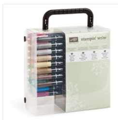
Many Marvelous Markers - 131264