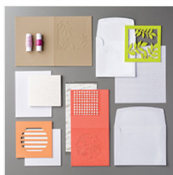
Flora & Flutter Kit Refill - 145547