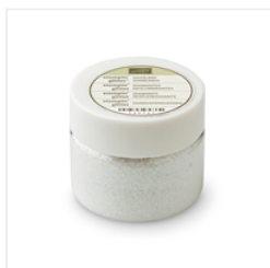
Dazzling Diamonds Stampin' Glitter - 133751