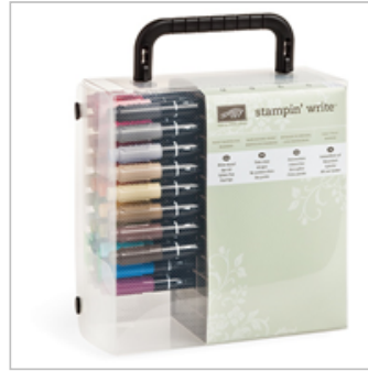
Many Marvelous Markers