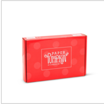
1-Month Prepaid Paper Pumpkin Subscription