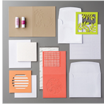
Flora & Flutter Kit Refill