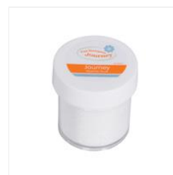
Journey Sparkle Dust - AC-0013