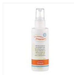
Journey Glaze 4 oz - AD-0002