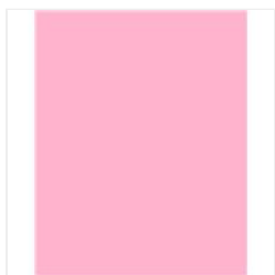
Bubble Gum 8.5x11 Cardstock - CS-0099