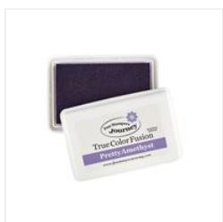
Pretty Amethyst True Color Fusion Ink Pad - IP-0018