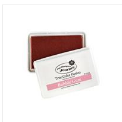
Bubble Gum True Color Fusion Ink Pad - IP-0058