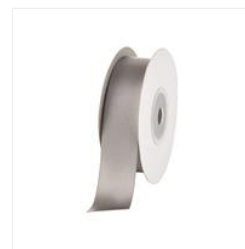
Satin Ribbon River Stone - AC-0139