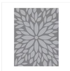
Petals Wall Embossing Folder - EF-0007