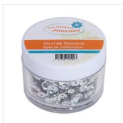
Journey Sequins Special Celebration - AC- 0115