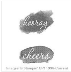
Reverse Words (Clear) - 143319