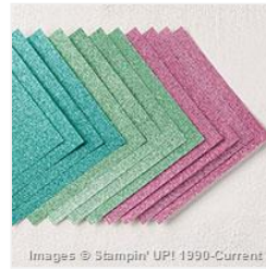
6" X 6" (15.2 Cm X 15.2 Cm) Glimmer Paper Assortment Pack - 143831