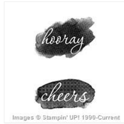
Reverse Words (Wood) - 143316