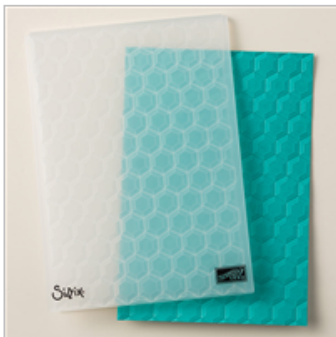
Hexagons Dynamic Textured Impressions Embossing Folder