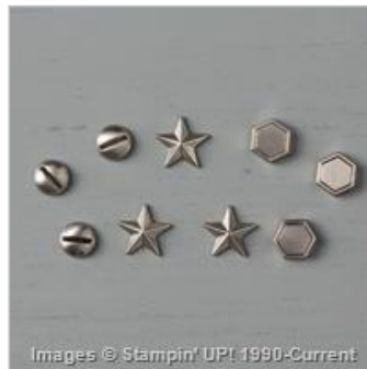
Urban Underground Embellishments