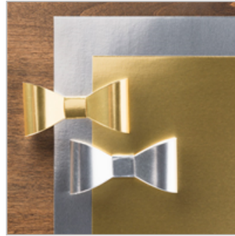
Silver Foil Sheets