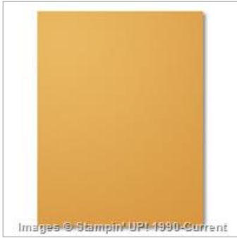
Delightful Dijon 8-1/2" X 11" Cardstock