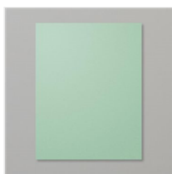
Mint Macaron 8- 1/2" X 11" Cardstock - 138337