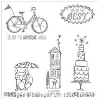
Life's Adventure Clear-Mount Stamp Set 133934