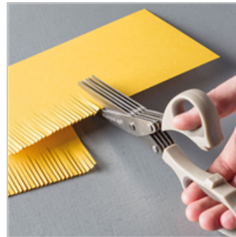
Fringe Scissors 133325