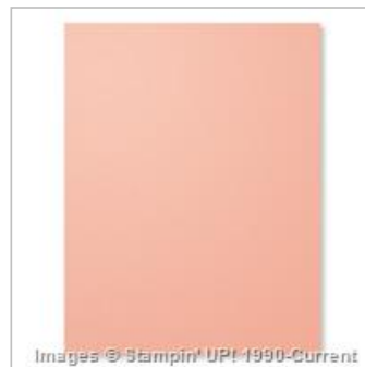
Crisp Cantaloupe 8- 1/2" X 11" Card Stock 131298