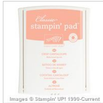
Crisp Cantaloupe Classic Stampin' Pad