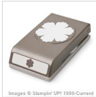
Blossom Punch 125603