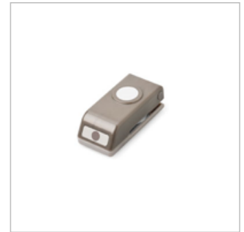
1/2" (1.3 Cm) Circle Punch 119869