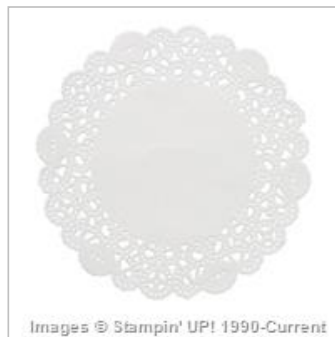
Tea Lace Paper Doilies 129399