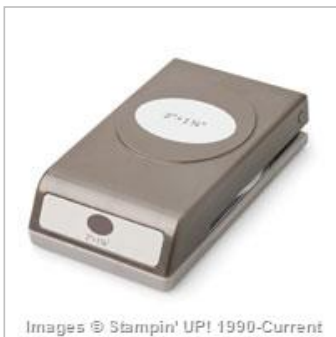
Extra-Large Oval Punch 119859