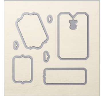
Chalk Talk Framelits Dies