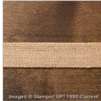
1-1/4" Burlap Ribbon