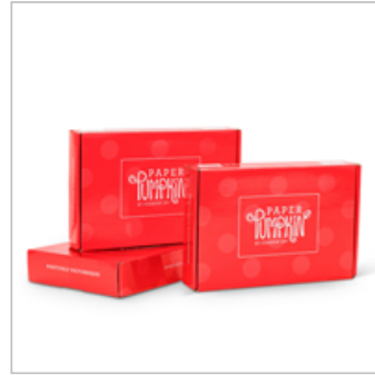
3-Month Prepaid Paper Pumpkin Subscription