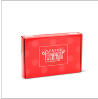
1-Month Prepaid Paper Pumpkin Subscription