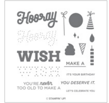
Broadway Birthday Photopolymer Stamp Set