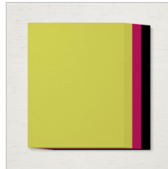
Broadway Bound 8- 1/2" X 11" Cardstock Pack