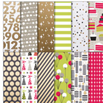
Broadway Bound Specialty Designer Series Paper