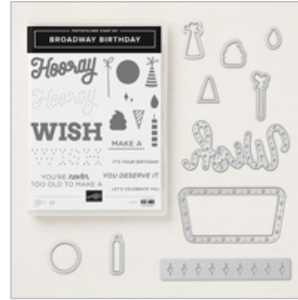
Broadway Birthday Photopolymer Bundle