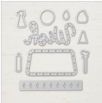
Broadway Lights Framelits Dies