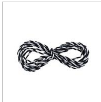
Journey Twine Licorice Twist