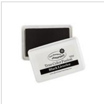
Black Licorice True Color Fusion Ink Pad