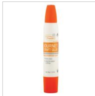
Journey Craft Glue