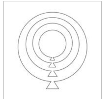
Uplift Die Set