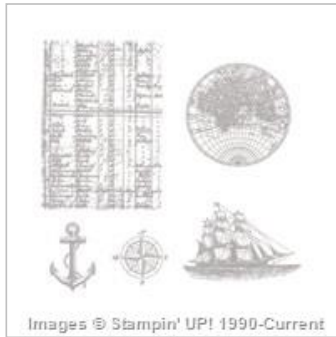
The Open Sea Clear-Mount Stamp Set