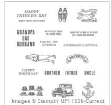
Guy Greetings Clear-Mount Stamp Set