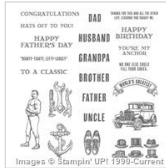
Guy Greetings Photopolymer Stamp Set