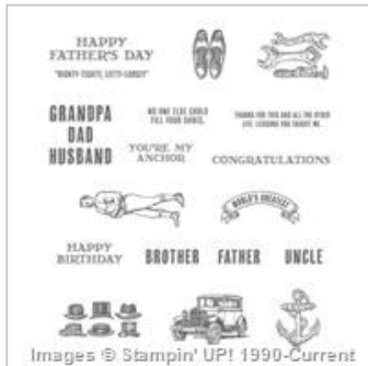
Guy Greetings Wood-Mount Stamp Set