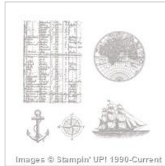
The Open Sea Wood-Mount Stamp Set