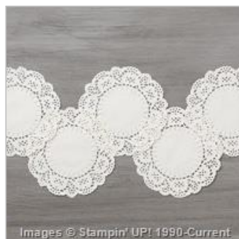
Delicate White Doilies