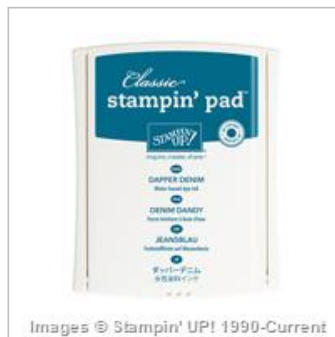
Dapper Denim Classic Stampin' Pad