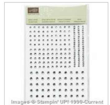
Rhinstone Basic Jewels