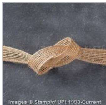
5/8" (1.6 Cm) Burlap