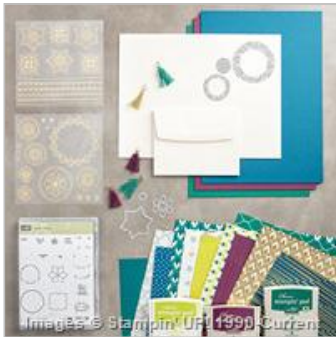
Eastern Palace Premier Bundle