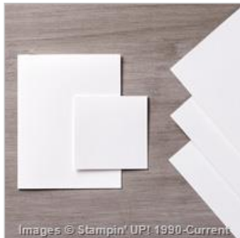
Whisper White 8-1/2" X 11" Thick Cardstock