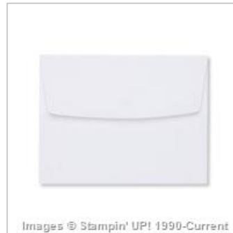
Whisper White Medium Envelopes