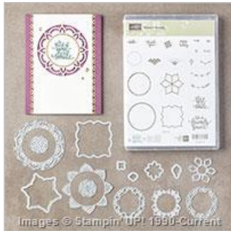
Eastern Beauty Photopolymer Bundle