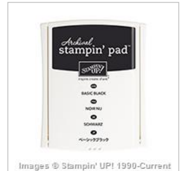
Basic Black Archival Stampin' Pad