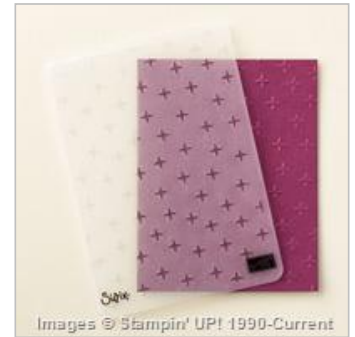
Sparkle Textured Impressions Embossing Folder