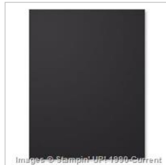
Basic Black 8-1/2" X 11" Cardstock