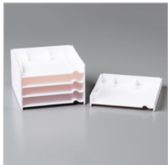
Ink Pad & Marker