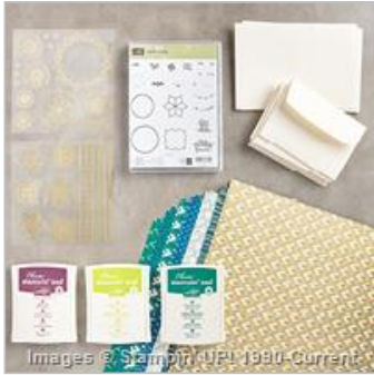
Eastern Palace Starter Bundle