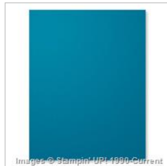
Dapper Denim 8-1/2" X 11" Cardstock