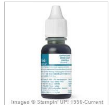
Dapper Denim Classic Stampin' Ink Refill