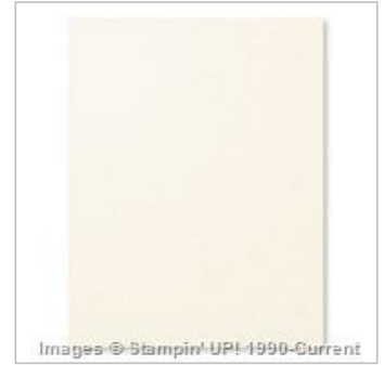
Very Vanilla 8-1/2" X 11" Cardstock