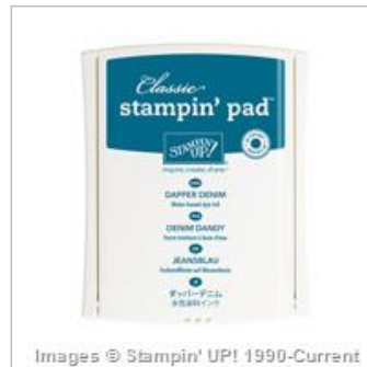
Dapper Denim Classic Stampin' Pad