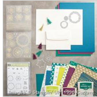
Eastern Palace Premier Bundle