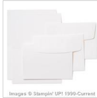
Whisper White Note Cards & Envelopes