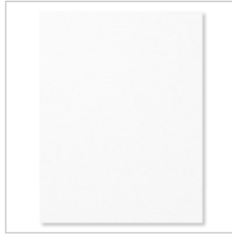
Whisper White 8-1/2\" X 11\" Cardstock