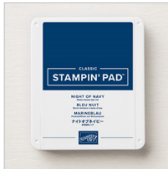
Night Of Navy Classic Stampin' Pad