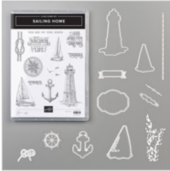
Sailing Home Bundle