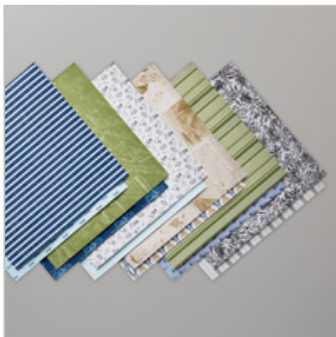
Come Sail Away Designer Series