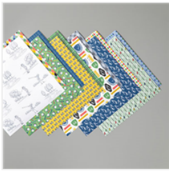
Country Club Designer Series Paper - 151314