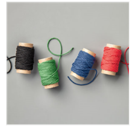
Country Club Twine Combo Pack - 151318