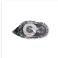
Snail Adhesive - 104332