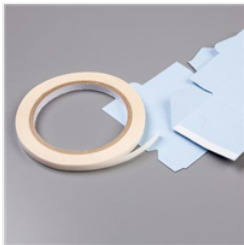
Tear & Tape Adhesive - 138995