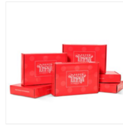
Prepaid Paper Pumpkin Subscription 6- Month - 137860