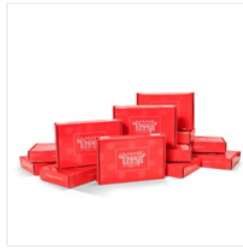
Prepaid Paper Pumpkin Subscription 12- Month - 137861