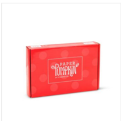
Prepaid Paper Pumpkin Subscription 1- Month - 137858