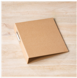
Kraft 6" X 8" Album - 144764