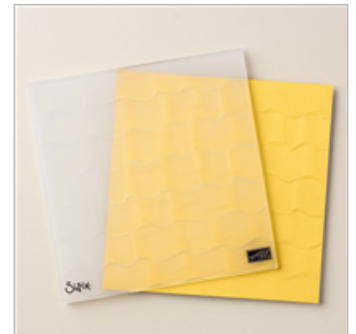
Ruffled Dynamic Textured Impressions Embossing Folder