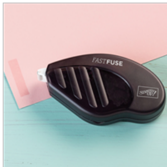
Fast Fuse Adhesive