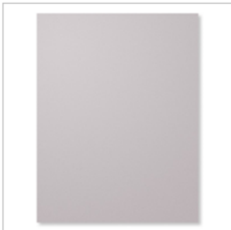
Smoky Slate 8-1/2" X 11" Cardstock