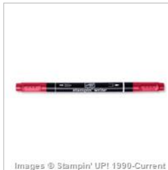
Real Red Stampin'