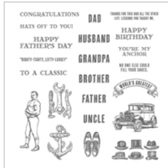
Guy Greetings Photopolymer Stamp