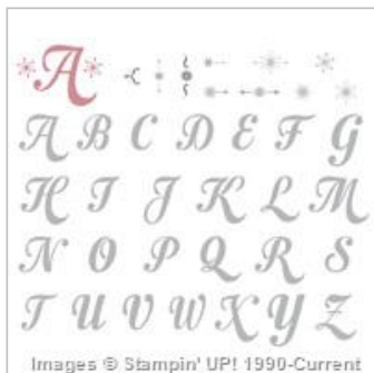
Merry Monogram Stamp Brush Set - Digital Download