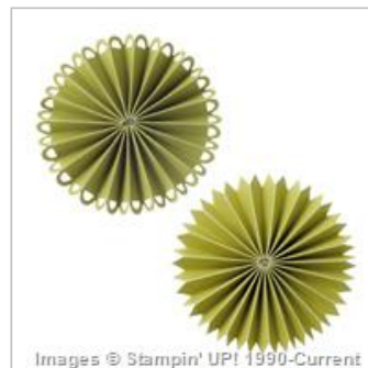
Rosette Designer Bigz XI Die