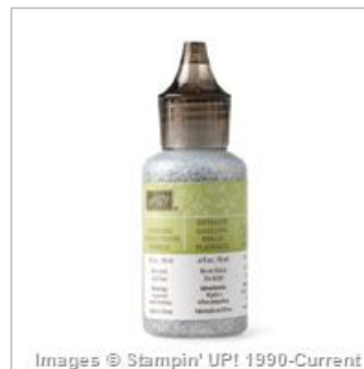
Silver Sparkle Dazzling Details