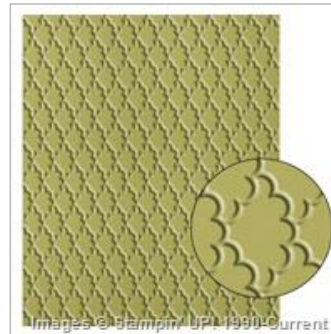
Fancy Fan Textured Impressions Embossing Folder