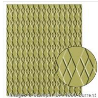
Argyle Textured Impressions Embossing Folder