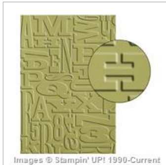
Alphabet Press Textured Impressions Embossing Folder